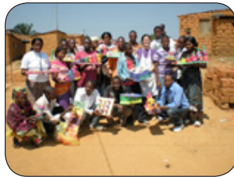
Uige Group with their toys