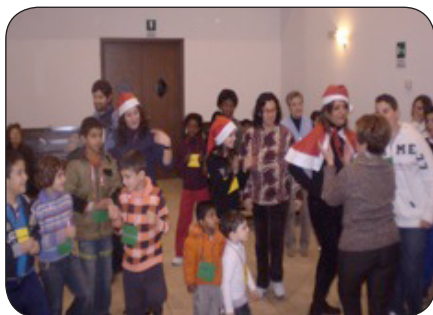
After school club party

The Christmas Party for the after school club kids on 19 December was a great success and a group of us ladies organised games, action songs and food. At a certain point a strange gentleman dressed in red made his appearance and distributed presents to the delight of the children.