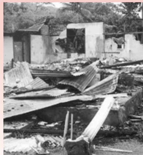
Indonesian church destroyed during recent religious conflict

The third stage is persecution which can be subtle or overt, and takes place often without penalty for the persecutors or protection for the persecuted. Persecution can come from the state, the police, the military, extremist organisations, mobs, paramilitary groups or religious zealots.