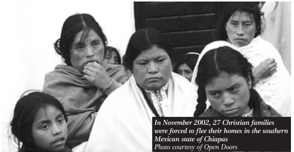
In November 2002, 27 Christian families were forced to flee their homes in the southern Mexican state of Chiapas

Love and forgiveness must characterise how Christians react