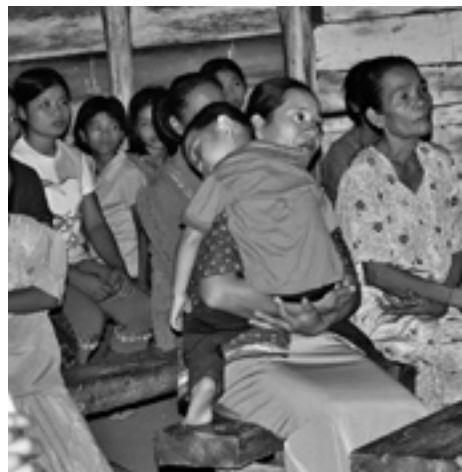
Church service in Sri Lanka

Many countries also do not allow the construction of places of worship, and churches are often destroyed.