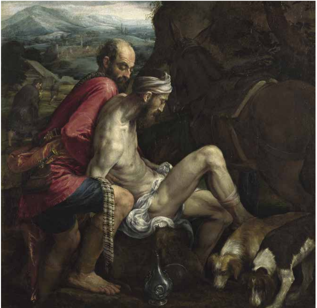
The Good Samaritan by Jacopo Bassano, 1562

discomfort, there was a greater good at stake. And importantly, I want to model for our children a loving attitude to others, showing them how our faith translates into everyday life.