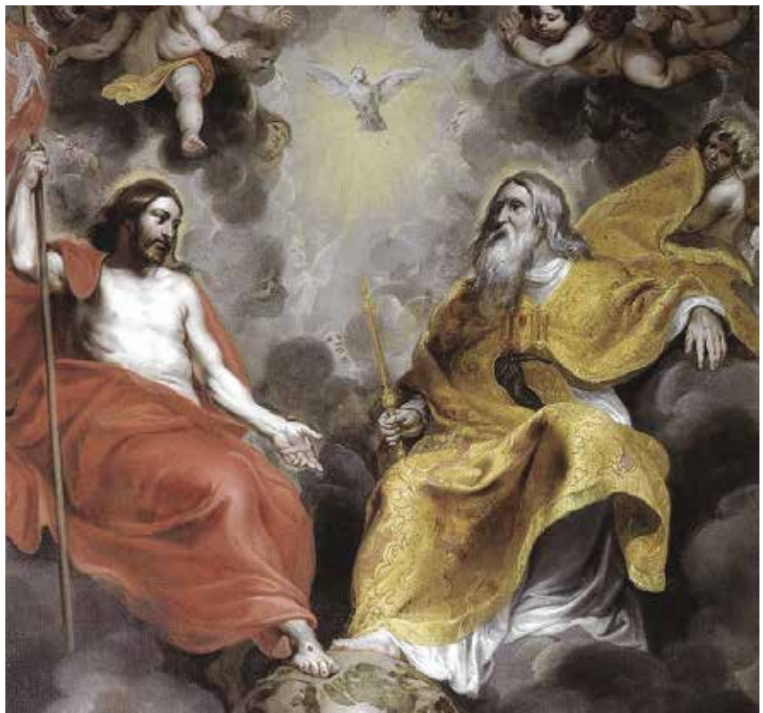
Hendrick van Balen the Elder, Holy Trinity, 1620s

Second, the apologetic aspect of Christian witness is crucial because otherwise we do not have a response to cultural relativism. People embrace cultural and religious relativism for a variety of reasons. It may be that like Pontius Pilate they have a profoundly pragmatist attitude to life and relationships and have pushed questions of truth to the margins of their lives (John 18:38) 2 . This may be because it allows them to live comfortably in the present without considering any questions about the ultimate meaning of life. It may be because they have political interests to push religious convictions to the private sphere. It may be that they have given up on ever finding the truth about God's salvation or ultimate meaning because of the vertigo of relativity induced by the many options. In all cases, a simple claim that Christianity is different will not provide an answer. We will need to argue what is at stake in what religion or worldview we embrace. Religious beliefs and practises are not just a byproduct of other realities such as economics, politics or social and psychological well-being. We will need to argue that the cultural and religious relativism's need themselves to be relativised as particular cultural and